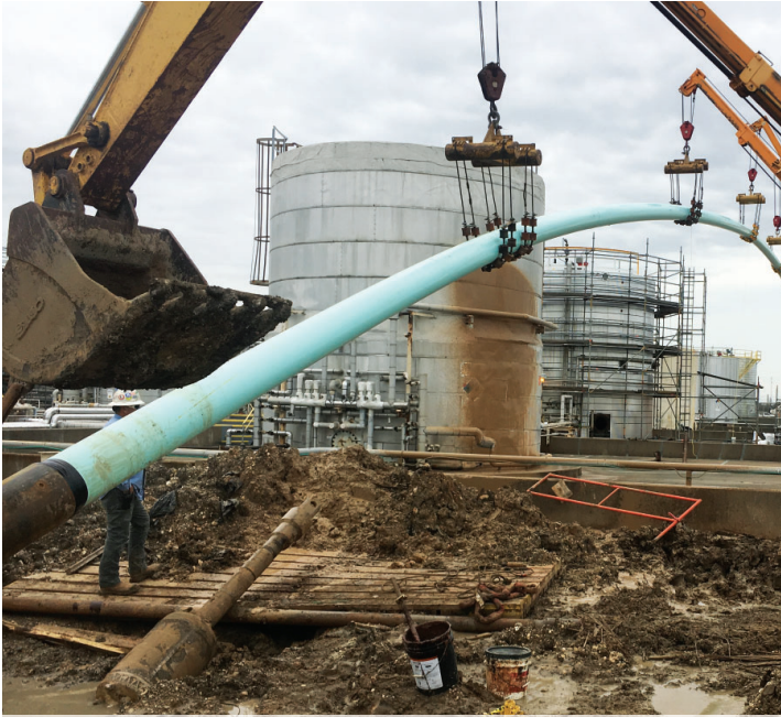
Horizontal Directional Drill