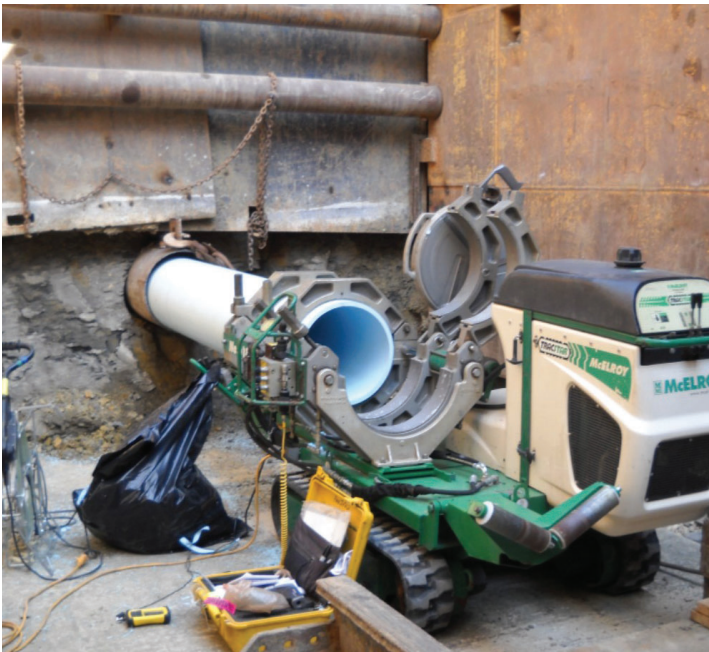
Slipline/Jack and Bore