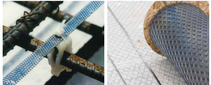
*ELGARD® is a trademark of De Nora Tech.

Since 1986, Corrpro's ELGARD®* mesh and ribbon anodes have been providing cathodic protection and stopping corrosion of reinforced concrete structures. These long-life titanium based mixed metal oxide anodes are specified around the world more than any other anode system.